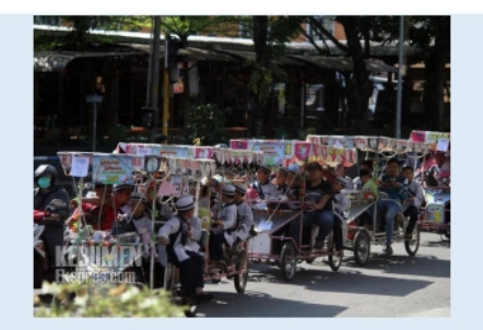
Gambar 4. Pawai Ta'aruf Khotmil Qur'an Kebumen

Pawai ta'aruf merupakan kegiatan arak-arakan dalam rangka memeriahkan Khotmil Qur'an di Kebumen. Banyak anak (santri) yang menaiki delman dan odong-odong dalam kegiatan pawai tersebut. Delman dapat bergerak karena kuda memberikan gaya, sehingga delman dapat bergerak searah dengan arah gerak kuda tersebut. Begitu juga dengan odong-odong, odong-odong dapat bergerak karena kita memberikan gaya dengan cara mengayuh, sehingga odong-odong dapat bergerak searah dengan arah kayuhan kaki kita. Mari kita cermati gambar 5 berikut dengan seksama!